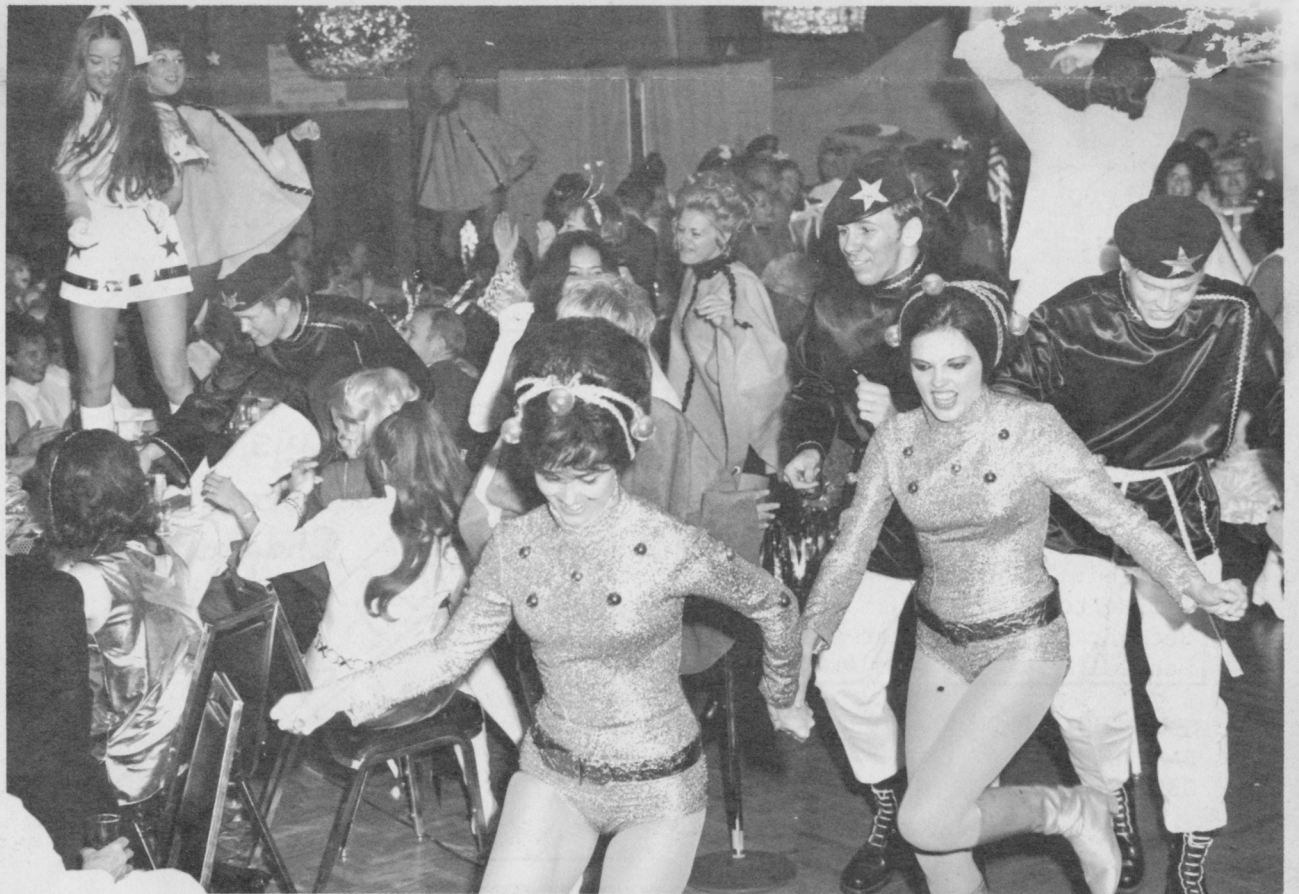
Air Force Officers & Cadets At New Style Air Force Revel.

Remember dinner at 1825 followed by the discussion. Come for both. If you must leave early, come anyway.