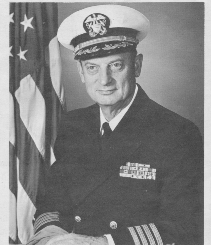
ANNAPOLIS CHAPLAIN TO SPEAK HERE